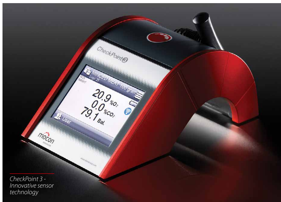
CheckPoint 3 - Innovative sensor technology